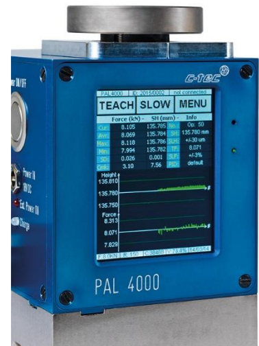
Presentation of the measurement results