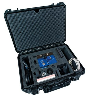
Robust case – protected from splash water and dust